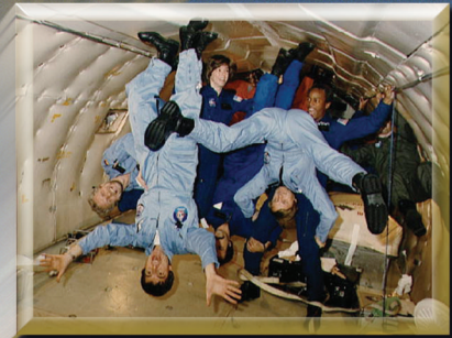
Shuttle crew training in weightless conditions on the KC-135.