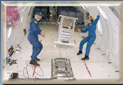
NASA Glenn researchers in weightless conditions on the KC-135.