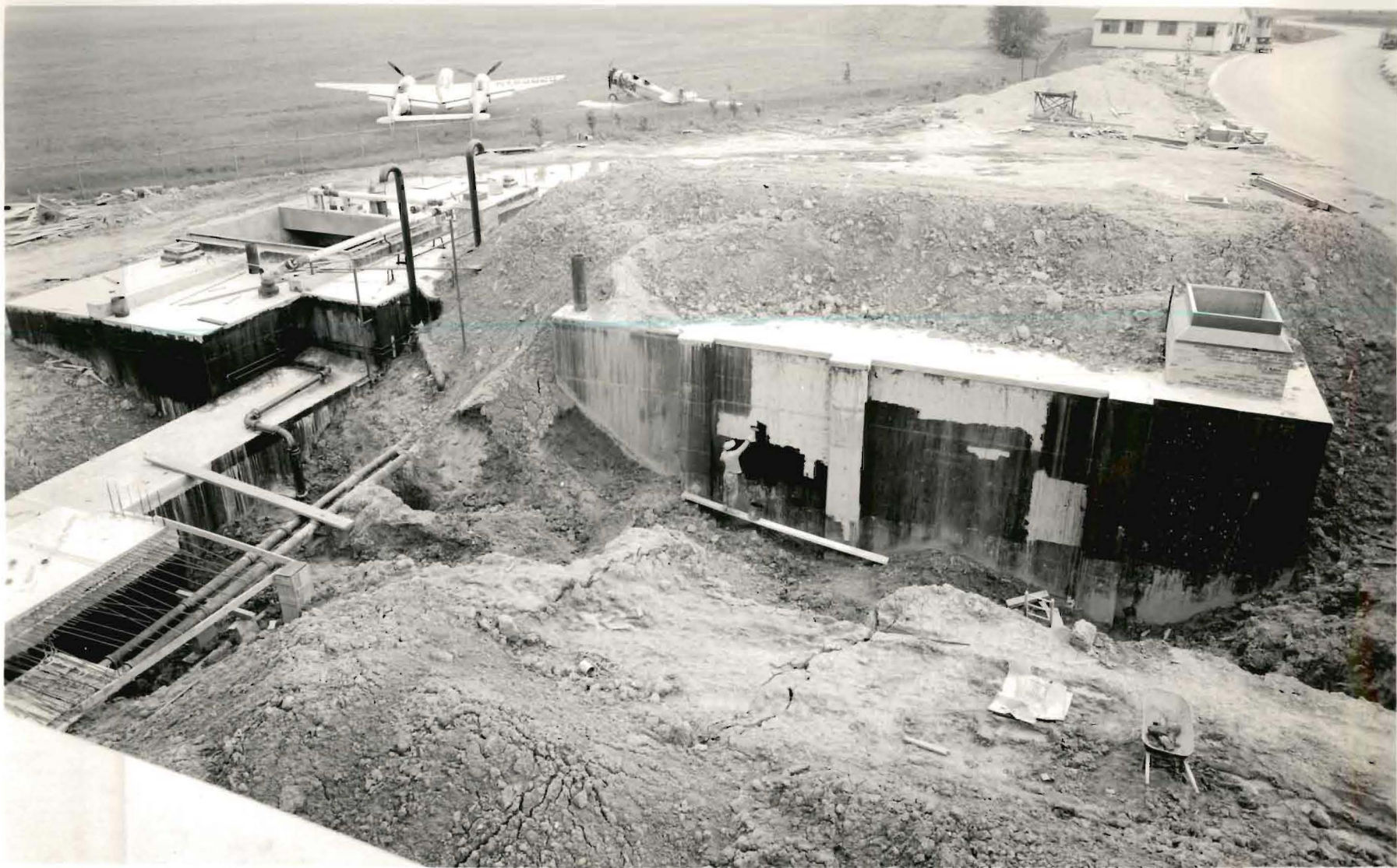
SOUTH WING ADDITION TO THE MATERIALS AND STRESSES RESEARCH LABORATORY Project No. 651

View looking southwest showing construction progress.