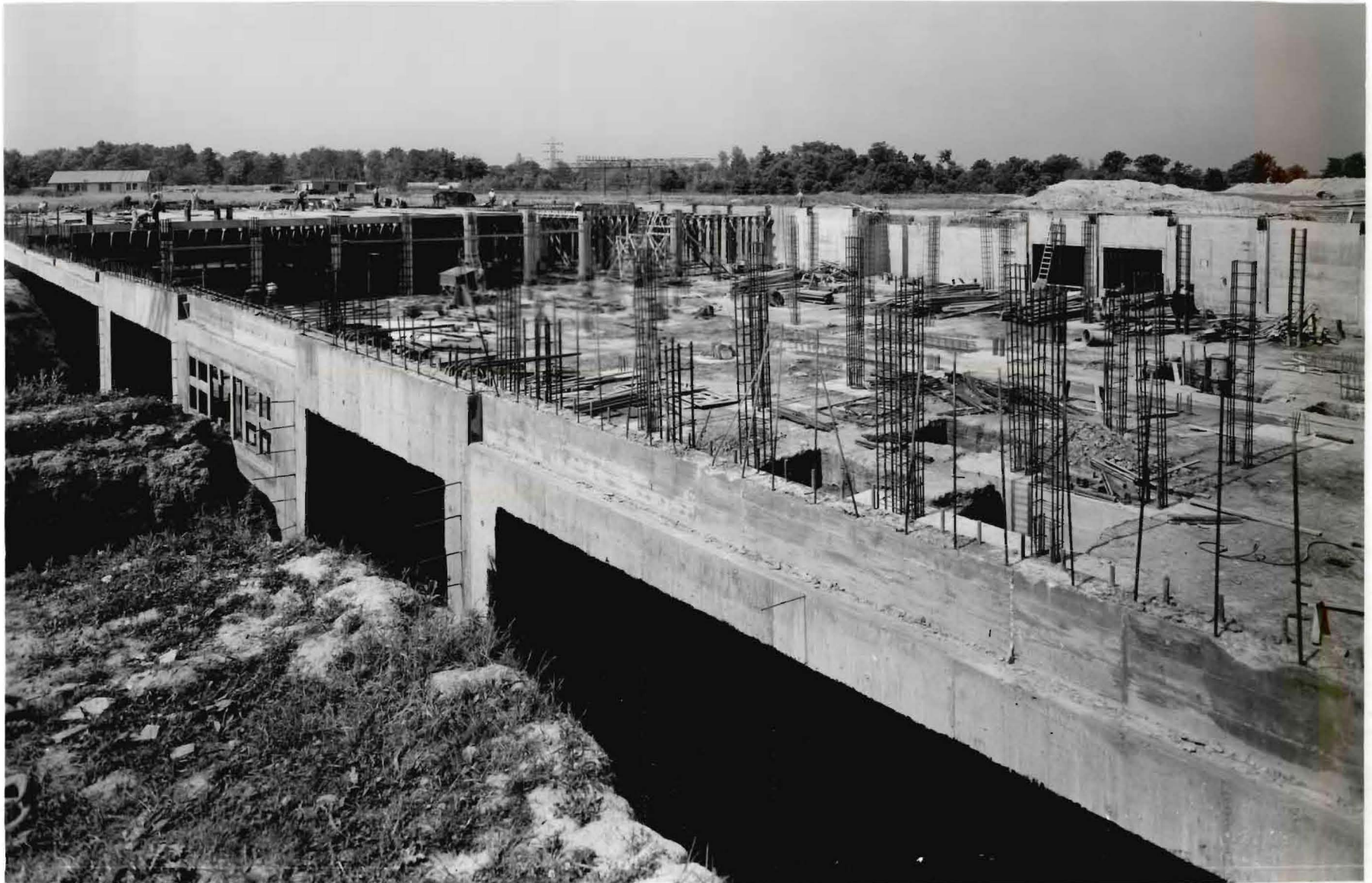
MATERIALS AND STRESSES RESEARCH LABORATORY Project No. 651 View looking southwest showing construction progress.