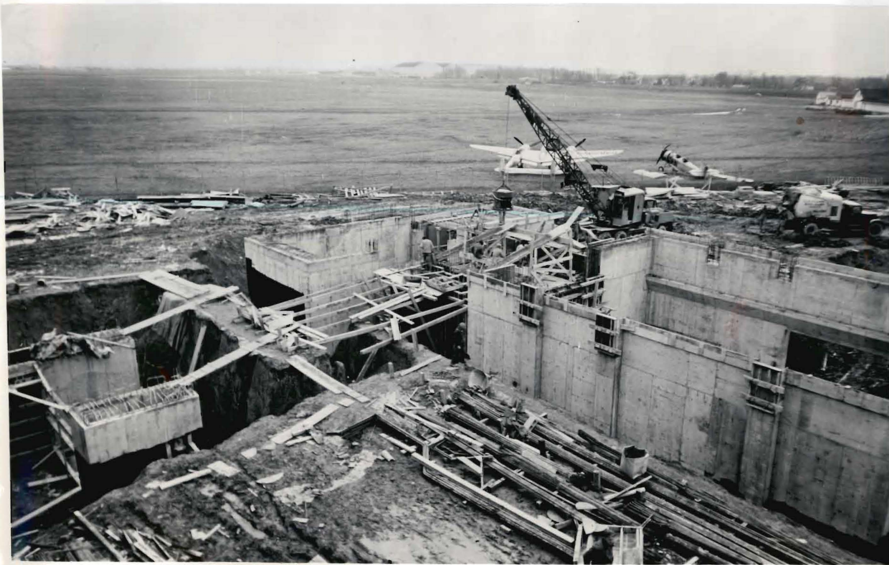
SOUTH WING ADDITION TO MATERIALS AND STRESSES RESEARCH LABORATORY Project No. 651A

View looking southeast showing construction progress.