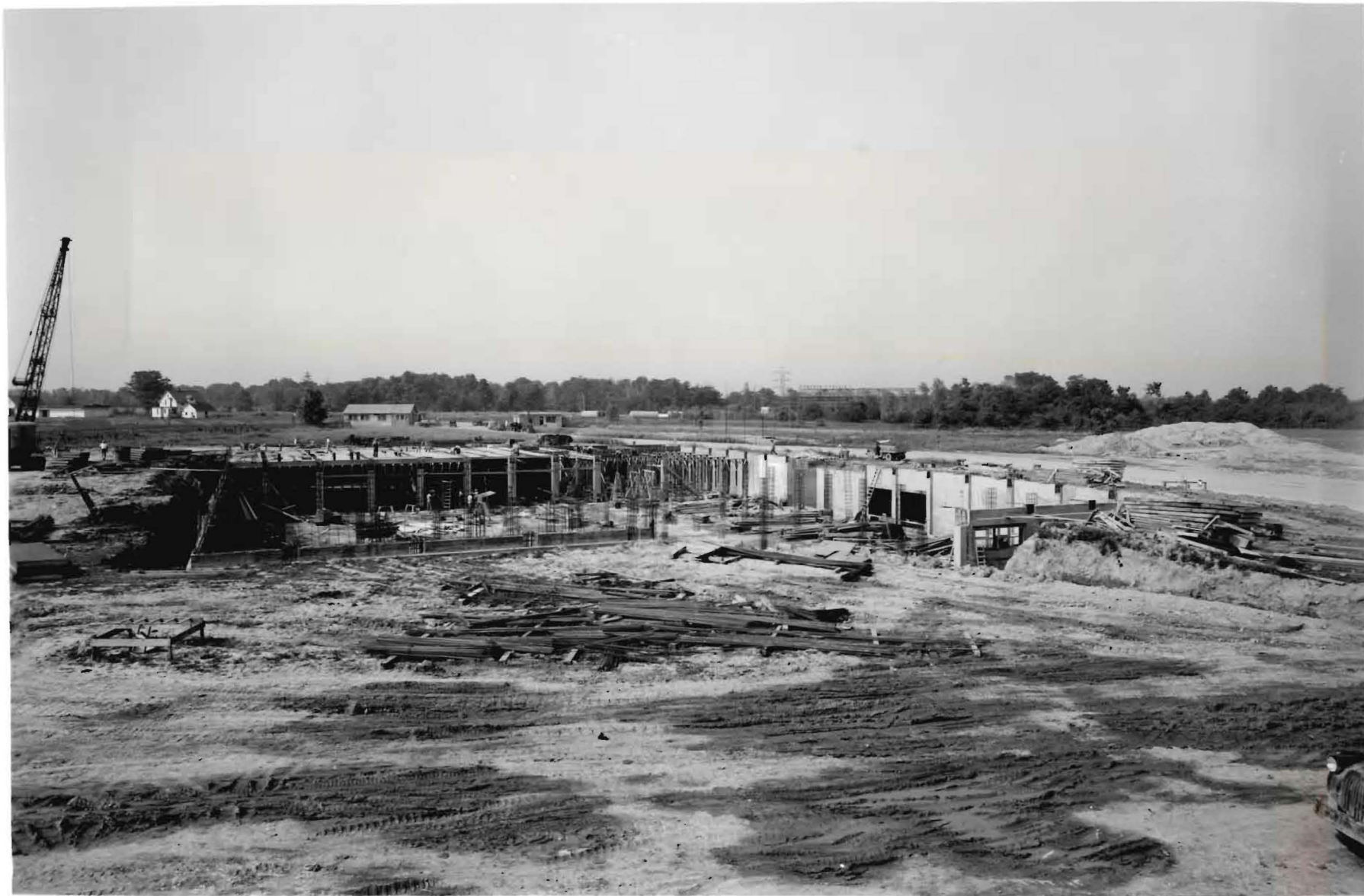
MATERIALS AND STRESSES RESEARCH LABORATORY Project No. 651 View looking southwest showing construction progress - detail.