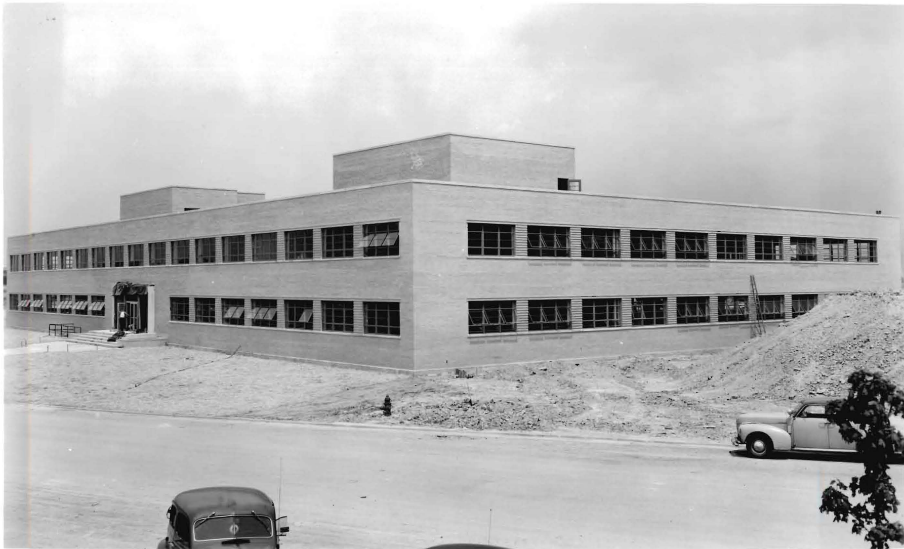
MATERIALS AND STRESSES RESEARCH LABORATORY Project No. 651

View looking northeast showing construction progress.