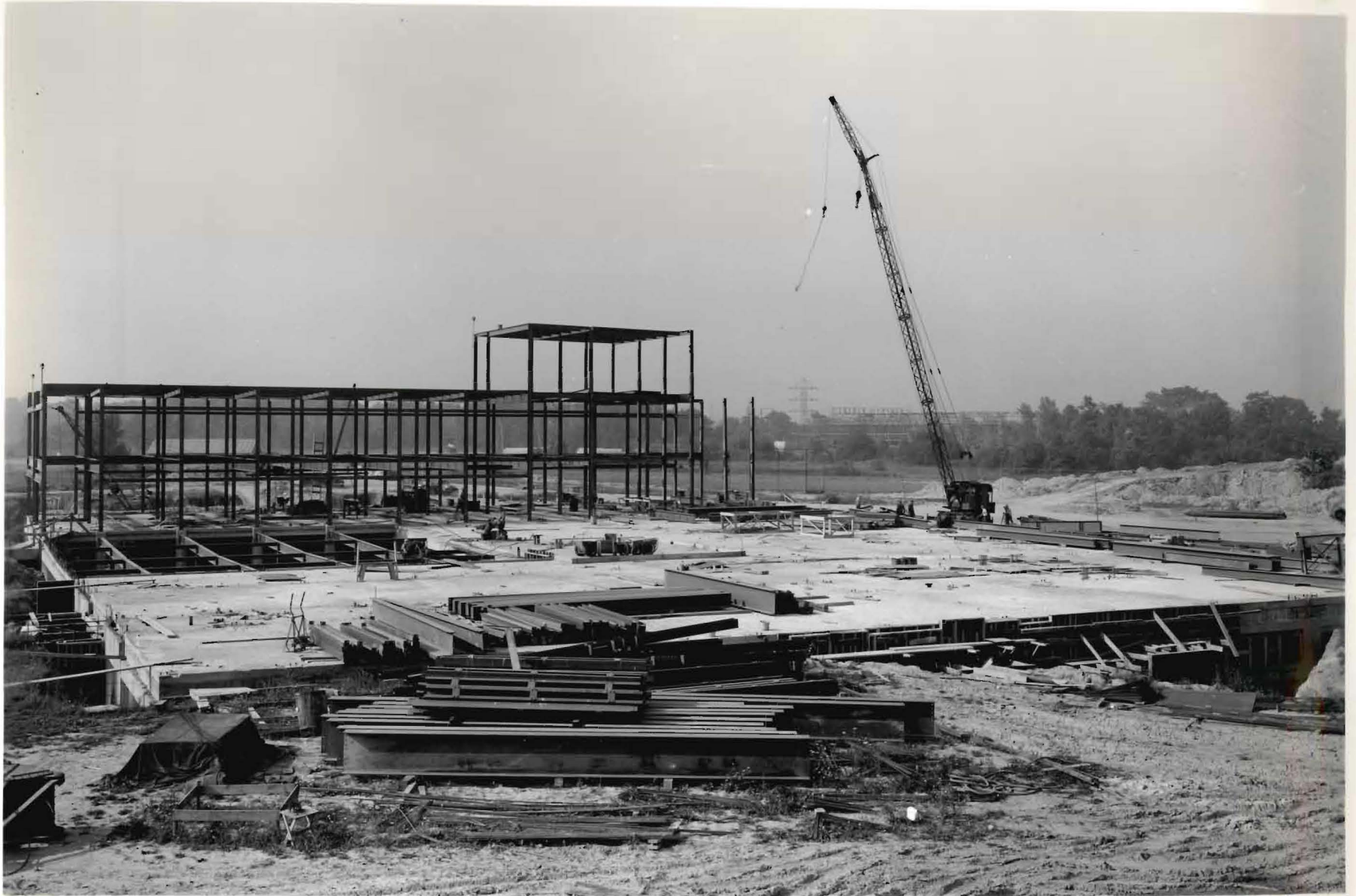
MATERIALS AND STRESSES RESEARCH LABORATORY Project No. 651

View looking south showing construction progress.