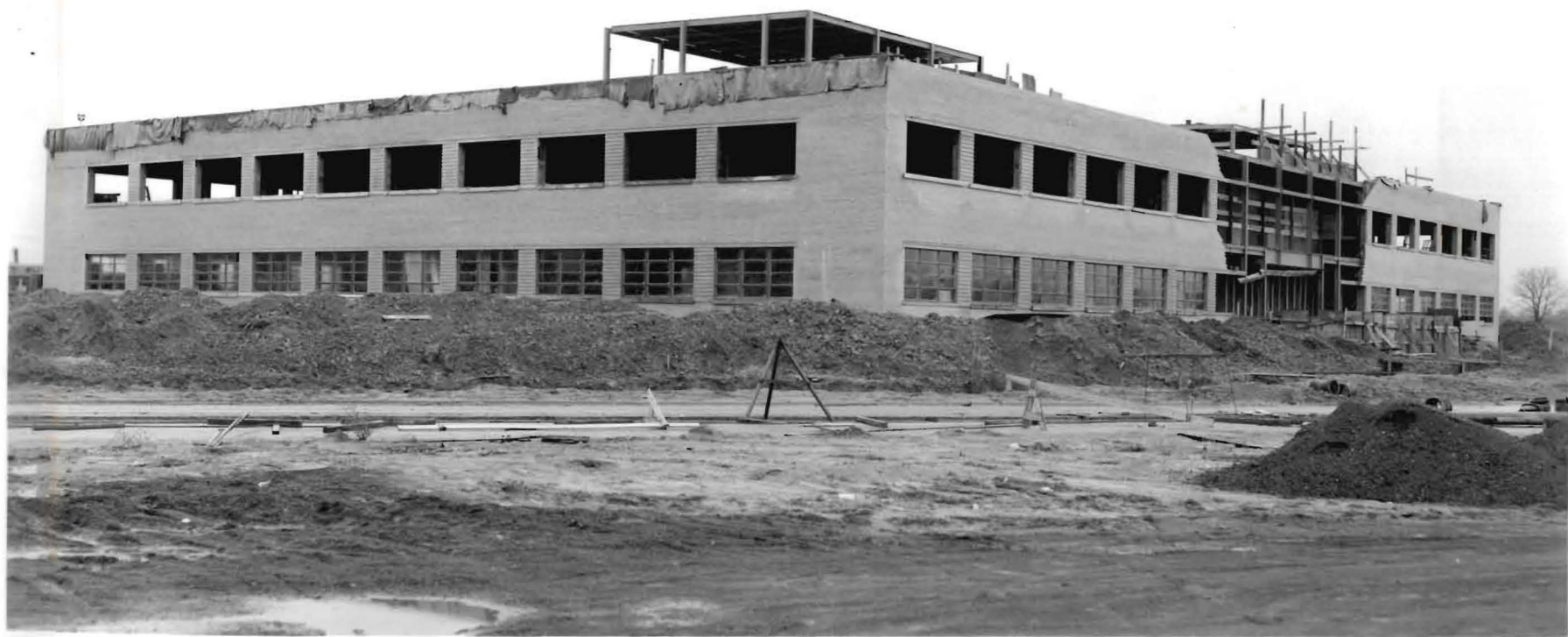
MATERIALS AND STRESSES RESEARCH LABORATORY Project No. 651

View looking southeast showing construction progress.