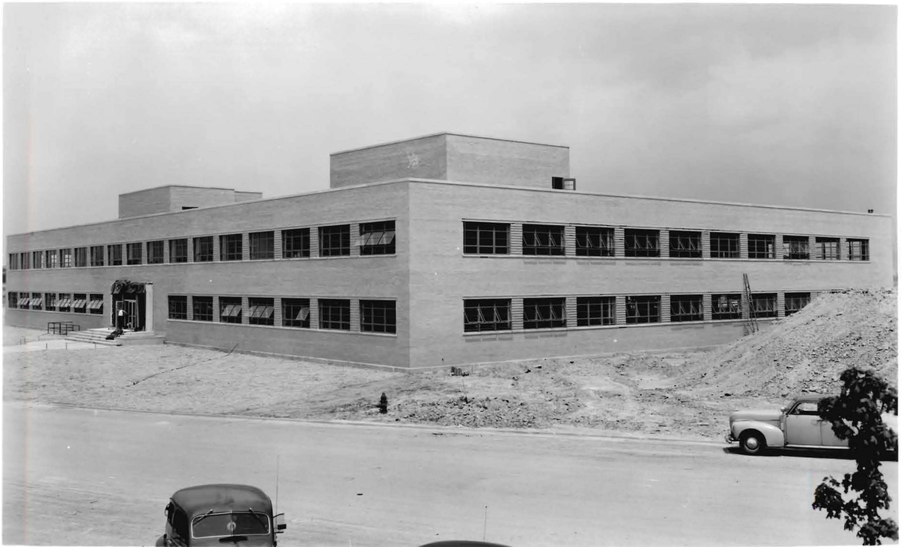
MATERIALS AND STRESSES RESEARCH LABORATORY Project No. 651

View looking northeast showing construction progress.