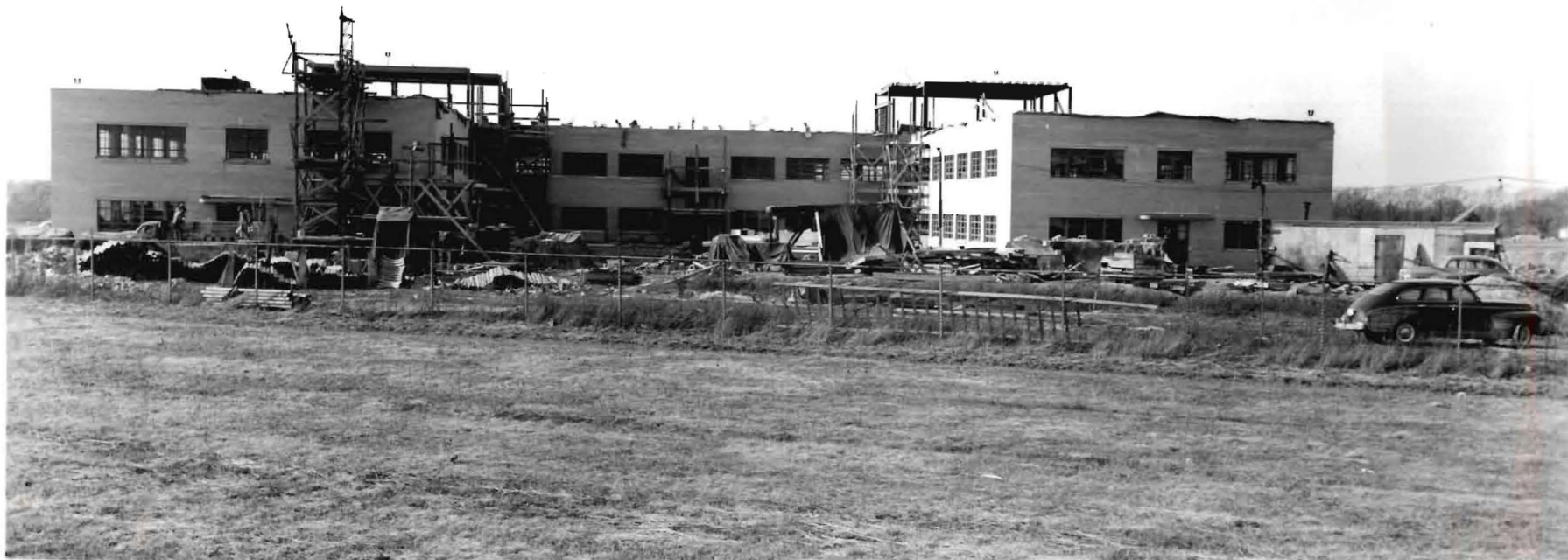
MATERIALS AND STRESSES RESEARCH LABORATORY Project No. 651

View looking west showing construction progress.