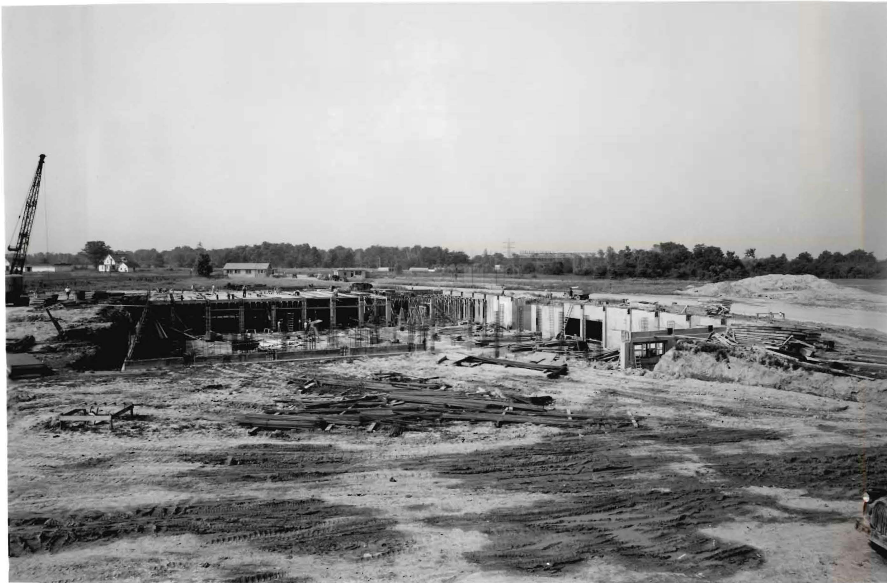
MATERIALS AND STRESSES RESEARCH LABORATORY Project No. 651 View looking southwest showing construction progress - detail.