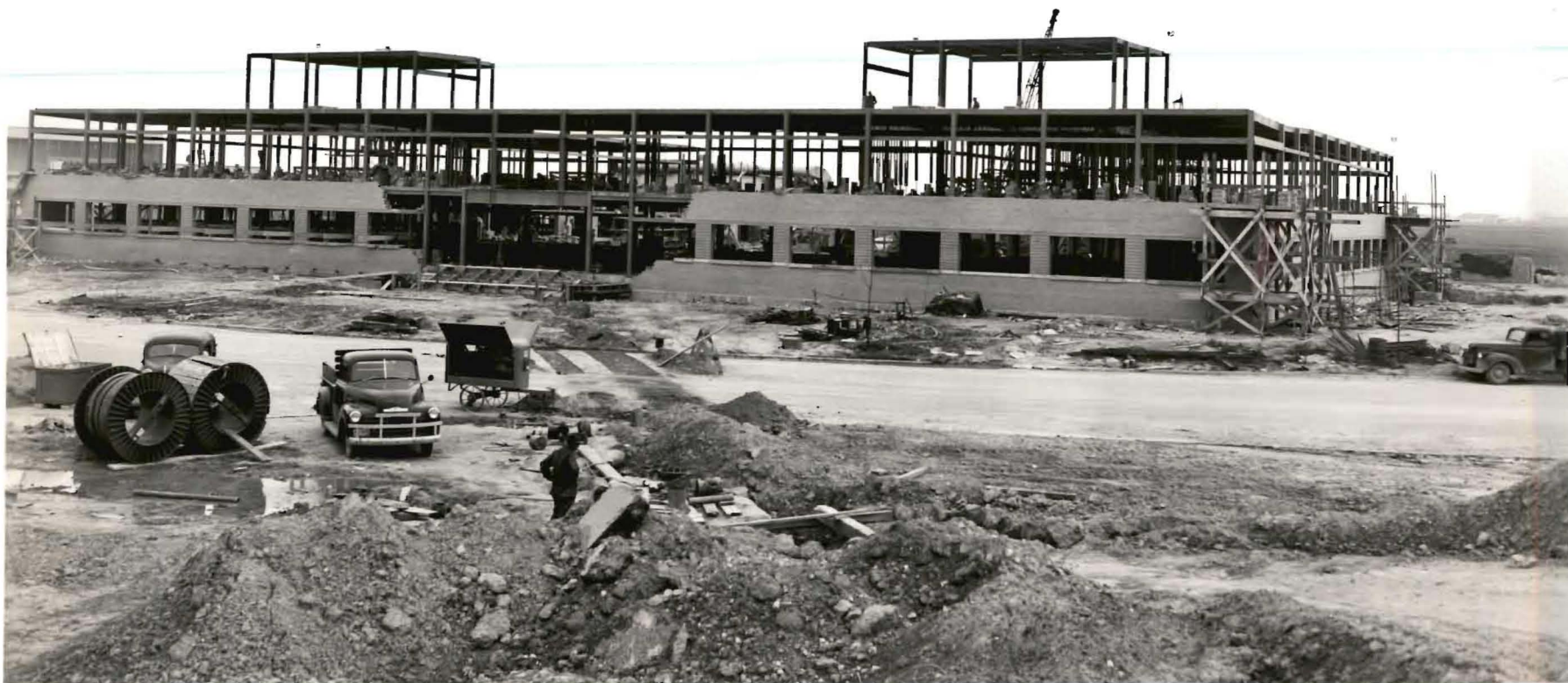
MATERIALS AND STRESSES RESEARCH LABORATORY Project No. 651

View looking east showing construction progress.