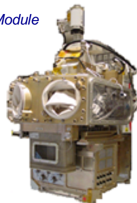
Light Microscopy Module (LMM)